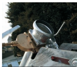
Top Fill Valve