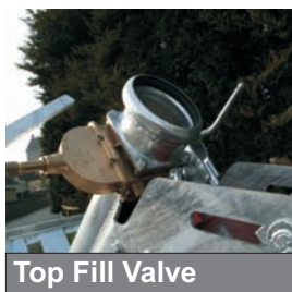
Top Fill Valve