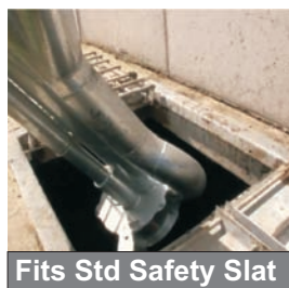
Fits Std Safety Slat