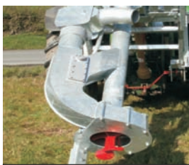
Larger Pipe Work