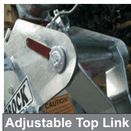
Adjustable Top Link

Over and above the specification of the original Redrock slurry pump, the super flow mixes faster, agitates further and increases productivity. This has been achieved by pairing a larger ratio gearbox with the steam line pipe system, designed to reduce power loss at all stages, therefore increasing overall performance. With a top fill option, an incremental diverter valve enables precise management of the slurry flow, allowing the user to agitate and top fill simultaneously if required. No disconnection of the PTO is required when lowering the pump into the tank.