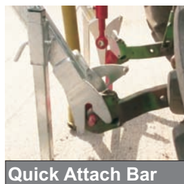
Quick Attach Bar